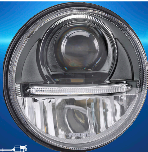
P/No. 72110 – High/Low Beam, DRL and Position Light Functions