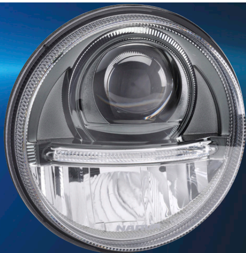
P/No. 72114 – High Beam and Direction Indicator Functions